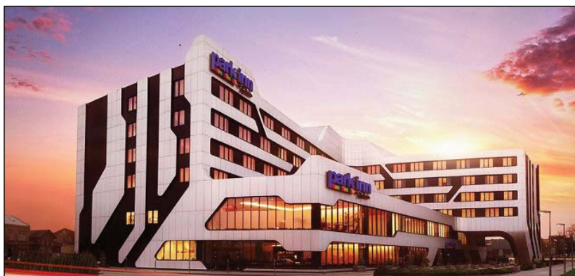
Hotel Park Inn